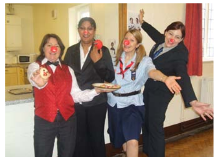
Red Nose Day March 2009

In addition to fundraising for the project itself, we have raised funds for charitable causes by putting on a Christmas Panto and by dressing up and selling cakes for Red Nose day.