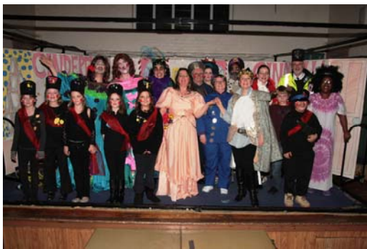
Cinderella December 2008